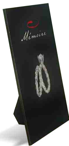
8.25" x 11" Counter Card