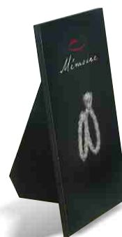
5.25" x 7" Counter Card